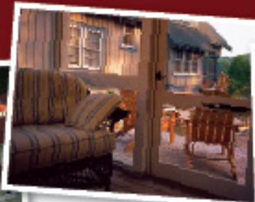
Cottages at Water's Edge